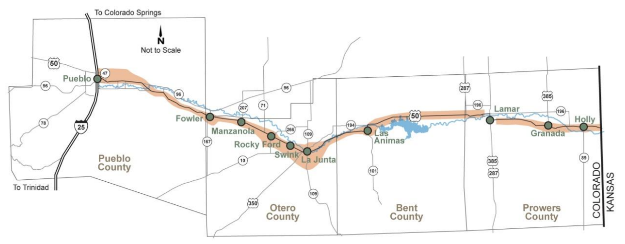
Figure 1-1. US 50 Tier 1 EIS Project Area

The project area does not include the city of Lamar. A separate Environmental Assessment (EA), the US 287 at Lamar Reliever Route Environmental Assessment, includes both US 50 and U.S. Highway 287 (US 287) in its project area, since they share the same alignment. The Finding of No Significant Impact (FONSI) for the project was signed November 10, 2014. The EA/FONSI identified a proposed action that bypasses the city of Lamar to the east. The proposed action of the US 287 at Lamar Reliever Route Environmental Assessment begins at the southern end of US 287 near County Road (CR) C-C and extends nine miles to State Highway (SH) 196. Therefore, alternatives at Lamar are not considered in this US 50 Tier 1 EIS.